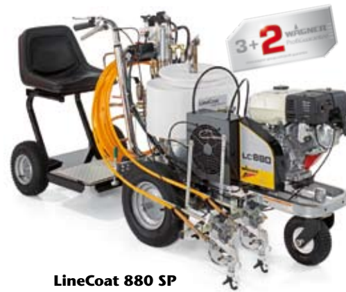
LineCoat 880 SP

The Mobile one with a seat – powerful for marking and lining jobs of all types. With comfortable seat and particularly high peak performance.