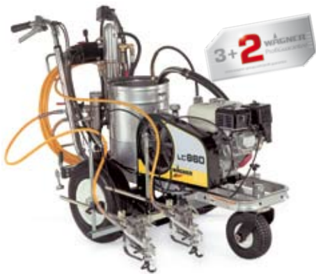
LineCoat 860 (860 SP)

The Powerful one – powerful for marking and lining jobs of all types. Available as standard or selfpropelled version.